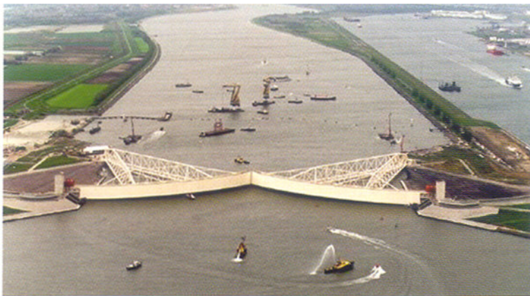
This retractable storm surge barrier spans 3,000 meters across the Eastern Scheldt in the Netherlands.

Cover photo: The Fraunces Tavern® was built in 1719 on marshy ground in lower Manhattan and was frequented by George Washington. At only a few feet above sea level, the area near the Battery is at risk for flooding should a huge storm surge accompany a 100-year storm.